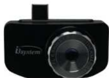
6.8 mm Lens Thermal Expert SCENE RANGE -10°C to 150°C