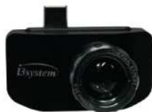
13 mm Lens Thermal Expert PLUS SCENE RANGE -10°C to 120°C