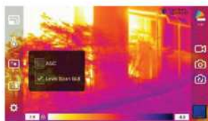
Level and Span