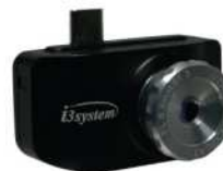
6.8 mm Lens Thermal Expert PRO SCENE RANGE -10°C to 250°C